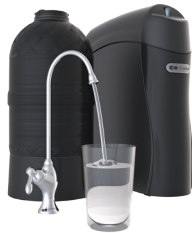
Kinetico K5 Drinking Water Station*