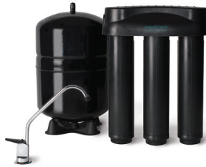
AquaKinetic® A200 Drinking Water System