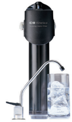
MACguard® Models 7000 & 7500